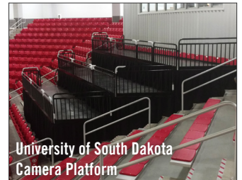
University of South Dakota Camera Platform