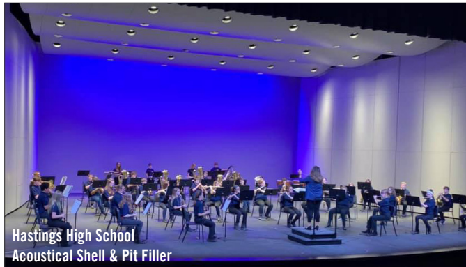
Hastings High School Acoustical Shell & Pit Filler