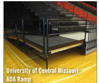
University of Central Missouri ADA Ramp