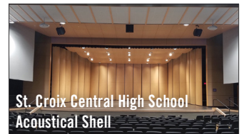
St. Croix Central High School Acoustical Shell