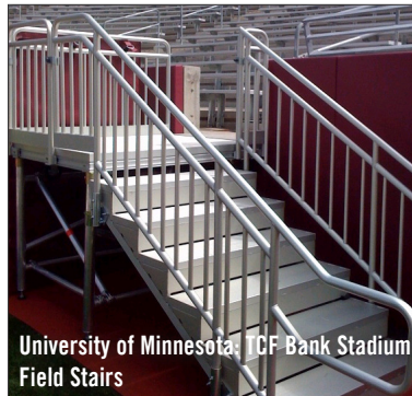
University of Minnesota: TCF Bank Stadium Field Stairs